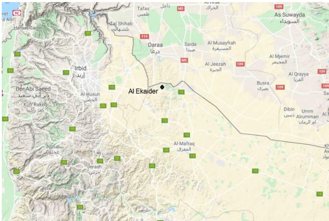
Figure 1: Location of the Al Ekaider site in the Northern Region of Jordan